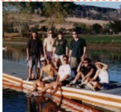
Some ITSers met together informally to go sailing before the weather got too cold